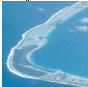
Atolls such as this one in French Polynesia are at risk of disappearing due to rising sea levels

Researchers claim to have found the first strong evidence that human activities are responsible for warming the world's oceans over the past 50 years.